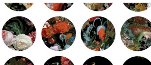
"Ocular Speculo"-oil on canvas-2014-Olsen gallery solo show (detail)